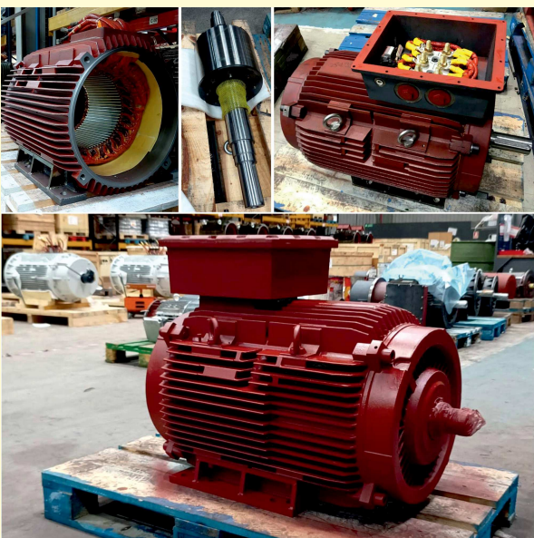
Permanent Magnet Motor production

New development project in the field of Explosion-proof Motors with and without Brakes will be announced in the foreseeable future.